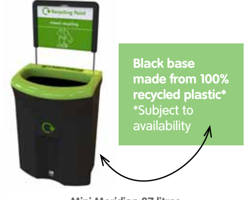
Mini Meridian 87 litres