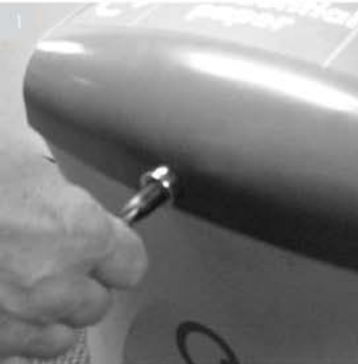
Turn key anti clockwise to unlock lid.