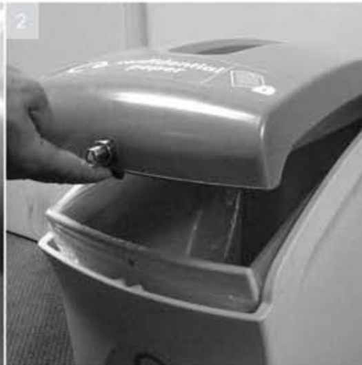
Lift lid from the front end, tilting backwards to free from rear locator.