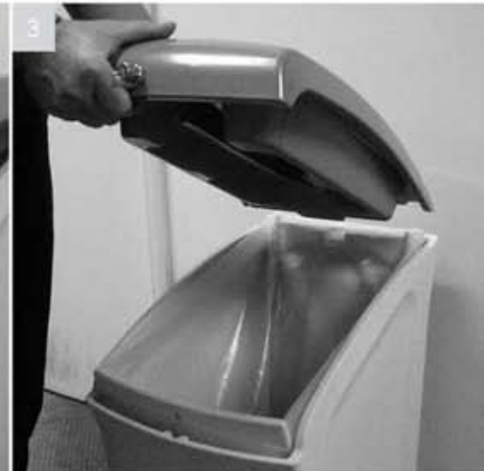
With two hands lift the lid clear of the body & put to one side.