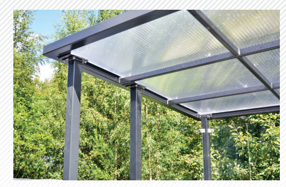
The bright roofing material gives an airy look to the shelter.