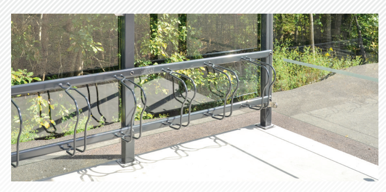
Akva bicycle shelter equipped with Treo bicycle rack.

polycarbonate roofing polycarbonate roofing