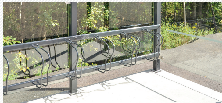
Akva bicycle shelter equipped with Treo bicycle rack.

polycarbonate roofing polycarbonate roofing