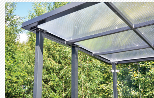
The bright roofing material gives an airy look to the shelter.