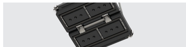
LENGTHWISE AND CROSSWISE POSITIONING