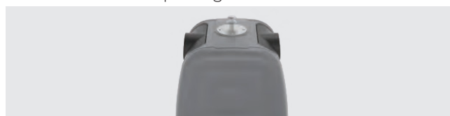
OPENINGS ON BOTH SIDES