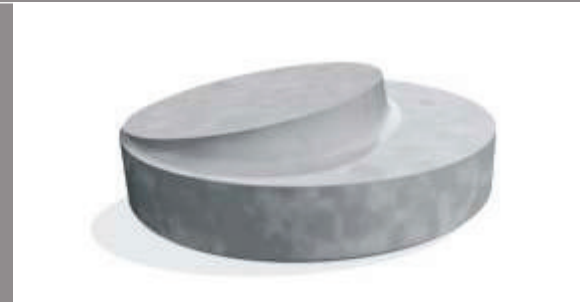
Bench Round 2